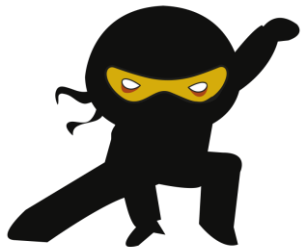
YEAR 4 - WHOLE SCHOOL SPELLING SYSTEM